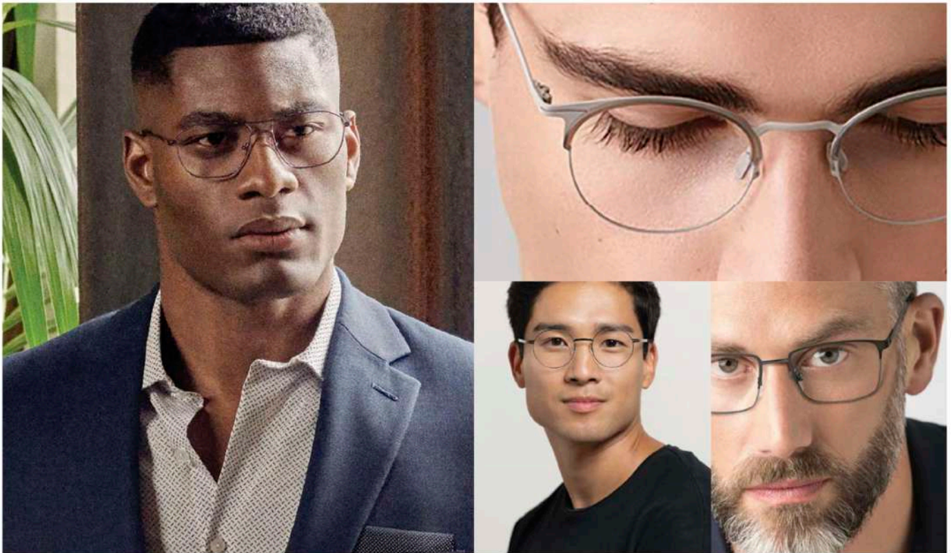
WESTGROUPE EVATIK E-9189 / MODO PTU 4422 / IC BERLIN Y15HVW90 / TURA TITANFLEX 820780