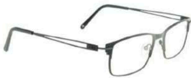
CLASSIQUE CIE SEC326T